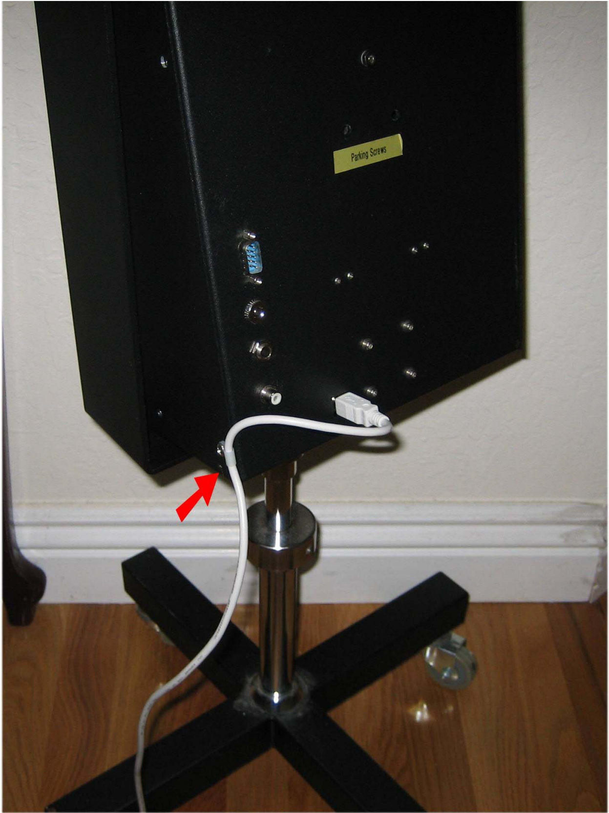
Figure 2. Teflon clip and the location of the clip