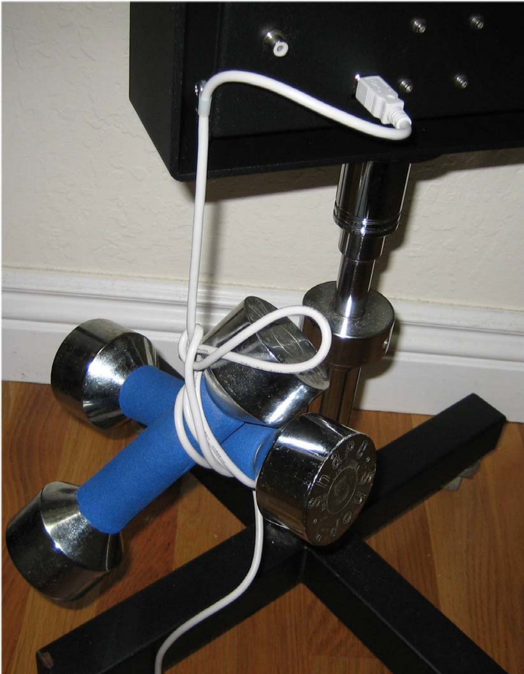
Figure 4. Ten-pound stress test

We advise our customers to use gentle force to plug the cable into the scanners. Please match the genders and directions of the USB cable and receptacles. Please use caution when move the scanner around and when use the scanner during the scan process.