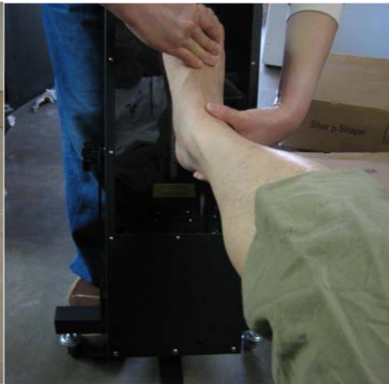
A possible use

The lower stand can be modified from our standard stand. Customers need to drill four through hole on the cross to accommodate the four mounting screws for the U-frame. The configuration is shown on the left.